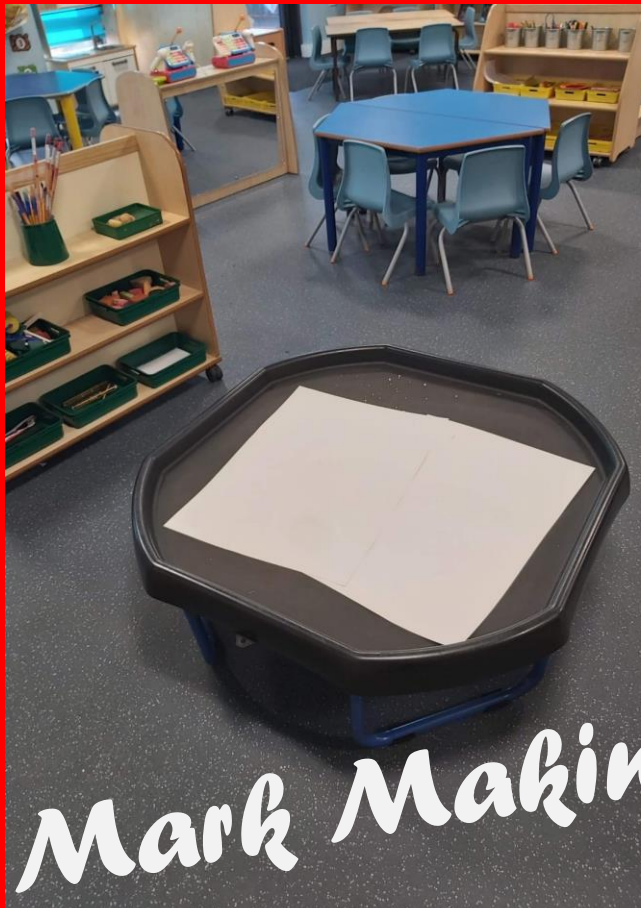
Mark Making Area